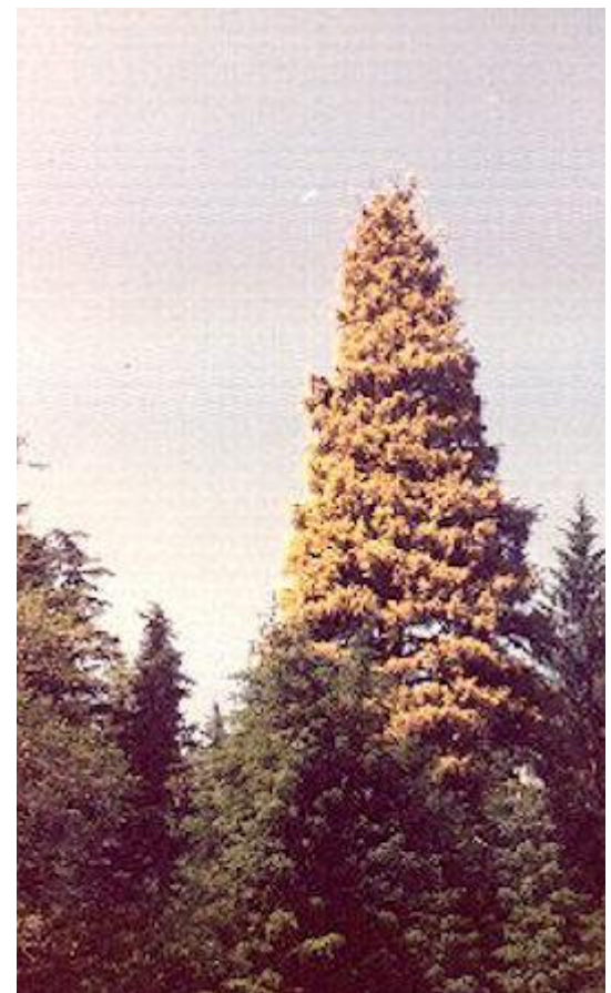
The golden spruce while it still stands, before it was cut down by Grant Hadwin.